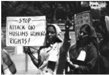
Muslim women are an important part of the women's movement in India.

not all – Muslims may wear a burqa , sport a long beard, wear a fez , and these become ways to identify all Muslims. Because of this, they tend to be identified differently and some people think they are not like the ‘rest of us’. Often this becomes an excuse to treat them unfairly, and discriminate against them. Do you remember reading in your Class VII book about how the Ansaris were finding it difficult to rent a house? This social marginalisation of Muslims in some instances has led to them migrating from places where they have lived, often leading to the ghettoisation of the community. Sometimes, this prejudice leads to hatred and violence.