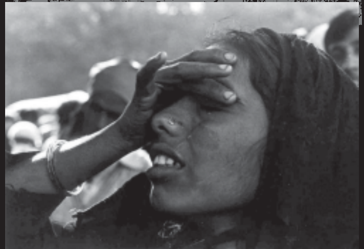
The next morning