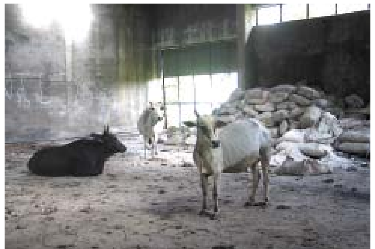
Bags of chemicals lie strewn around the UC plant