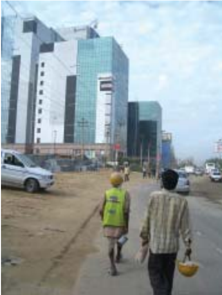
Accidents are common to construction sites. Yet, very often, safety equipment and other precautions are ignored.