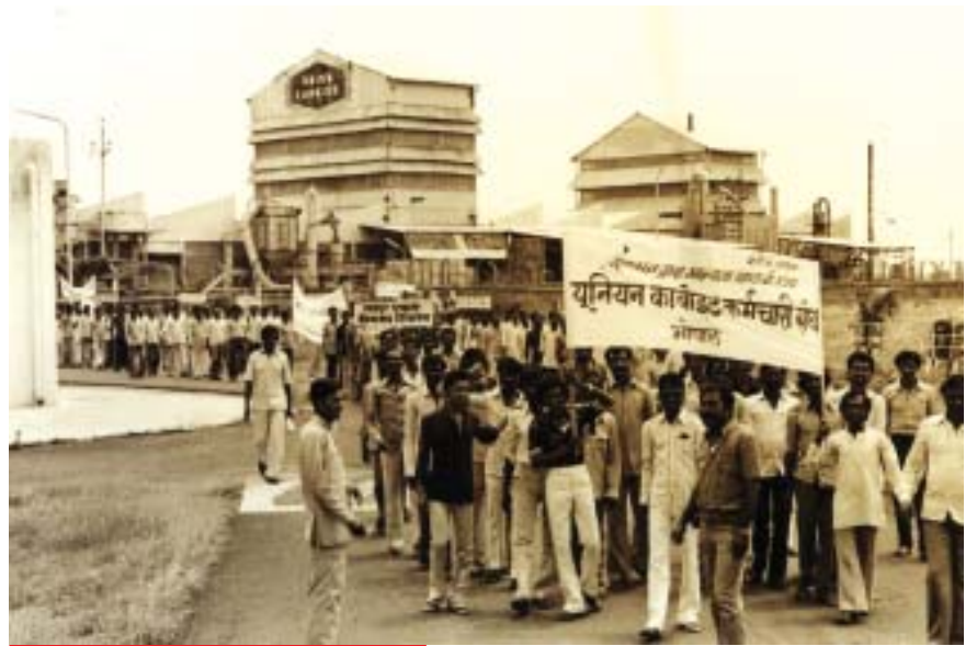
Members of UC Employees Union protesting